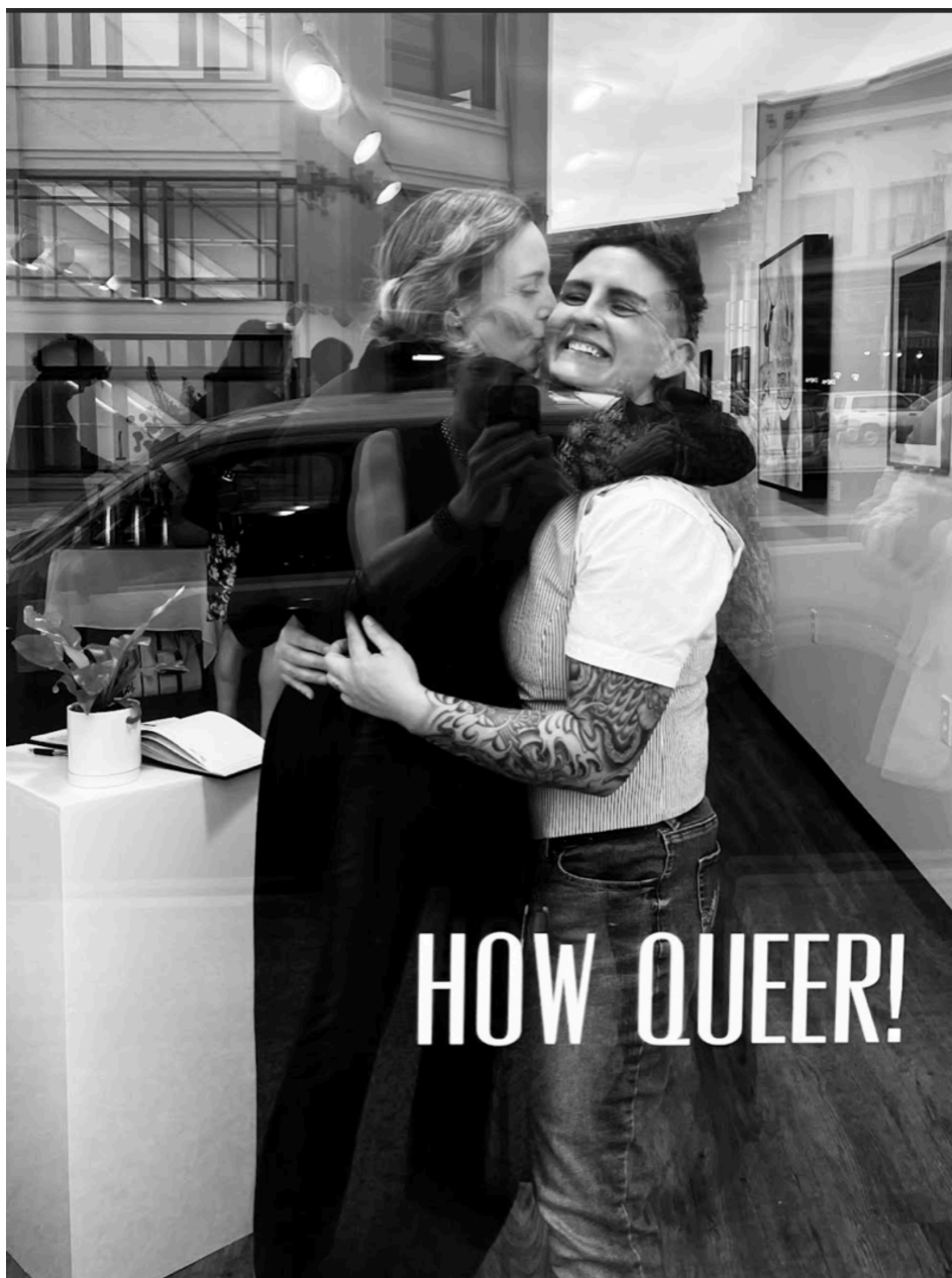
How Queer! 2025 opening night