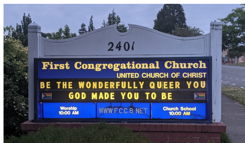
Reader board at First Congregational in Bellingham, 2021.