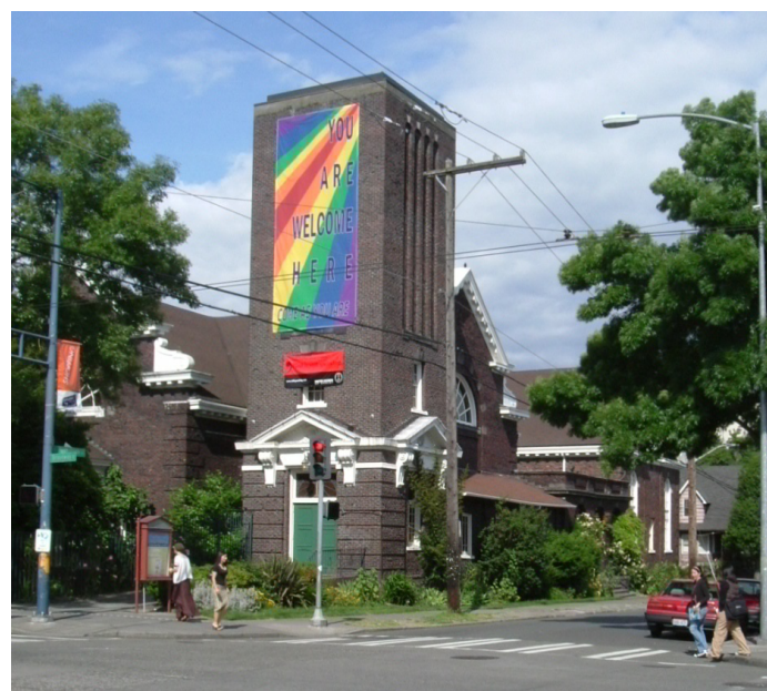
Rainbow flag at All Pilgrims Christian Church in Seattle, 2006.